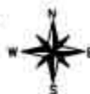
Location of Photographs (Figure B2)

License No. 85 Ferguson McIlveen Beechill House Beechill Road Belkiss BT9 7KP