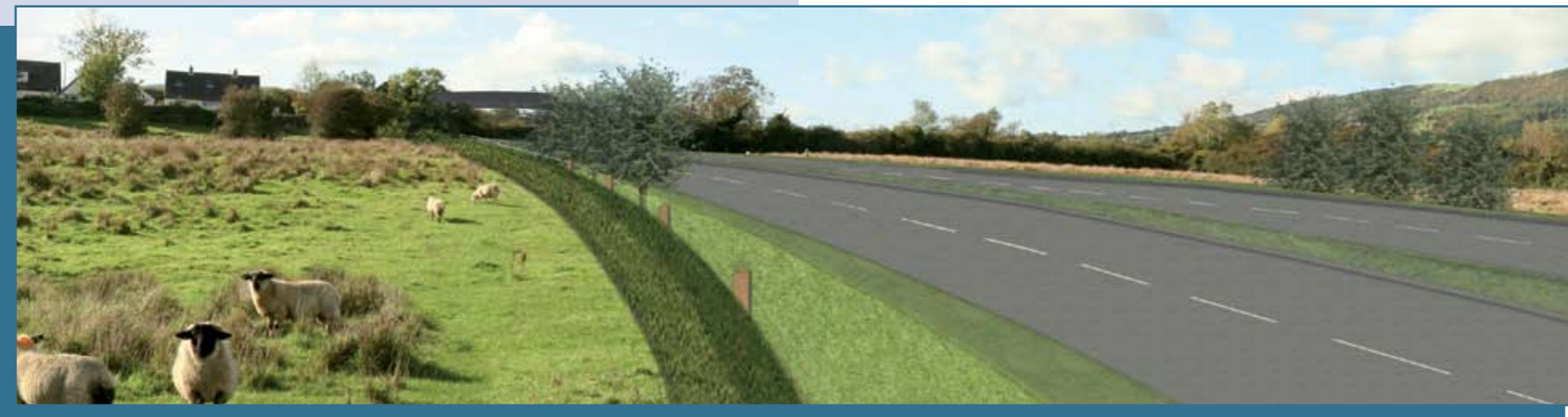
Photomontage - Looking west towards Whinfield Lane

Opening Hours: 21 March 2007 - 3.30pm-9.00pm 22 March 2007 - 10.00am-9.00pm