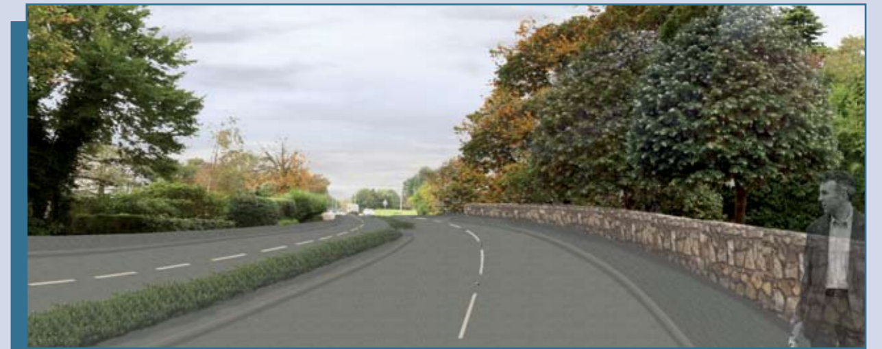
Belfast High School