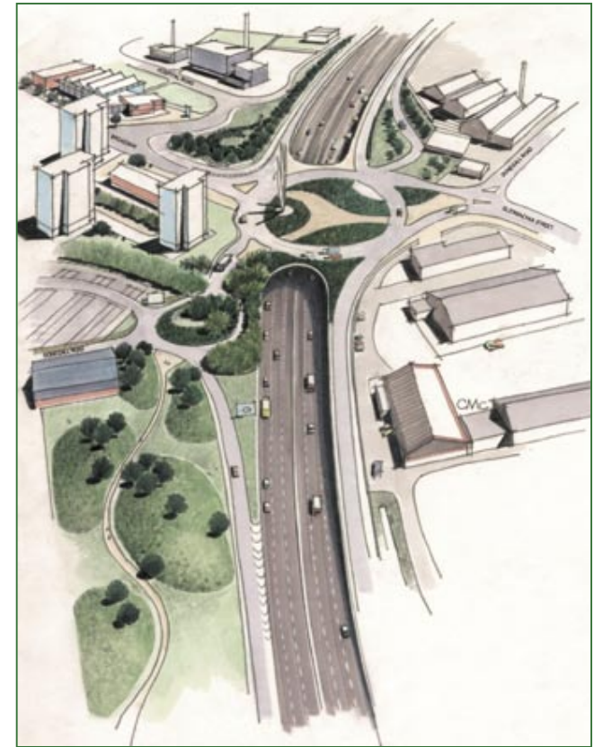
Artist's Impression of Proposed Underpass at Broadway